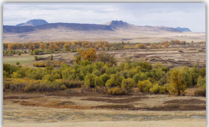
Wetlands, riparian areas, and uplands are all part of the Bird Creek Ranch landscape, as can be seen in this spectacular fall setting.