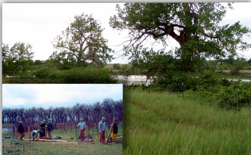
Eight miles of riparian fencing was installed in a partnership with the American Bird Conservancy and Montana Conservation Corps.