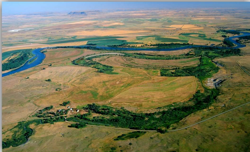
Aerial photo of Bird Creek Ranch showing Missouri River and Bird Creek riparian areas and 118 acre oxbow slough.